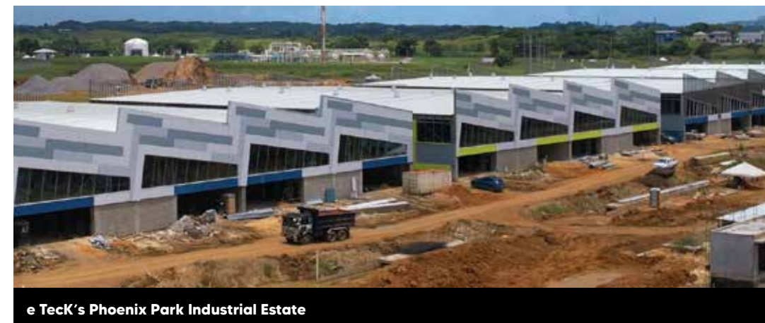
e Teck's Phoenix Park Industrial Estate

During 2021 - 2022, 3 BPO companies selected T&T for their next outsourcing destination – Teleperformance, Customer Acquisition Group and Bill Gosling Outsourcing. Combined, they seek to create an estimated 1,150 jobs .